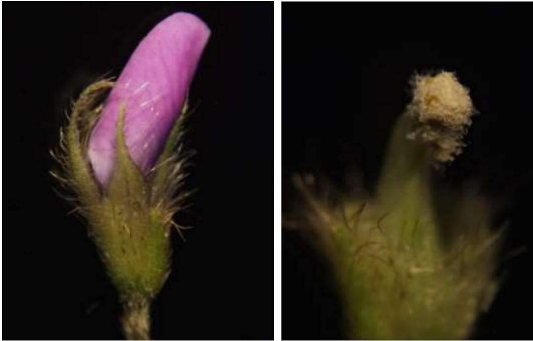
Supplementary Fig. 1 transgenic soybean flower buds which were selected as pollen supplier.

(left, whole flower; Right, removed petals flower)