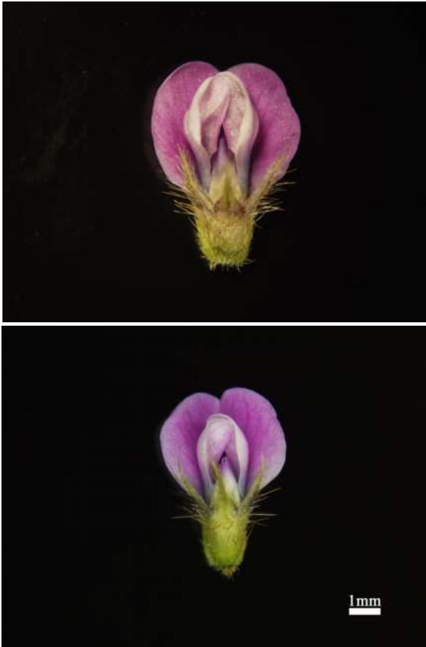
Supplementary Fig. 2 The flower of wild soybean