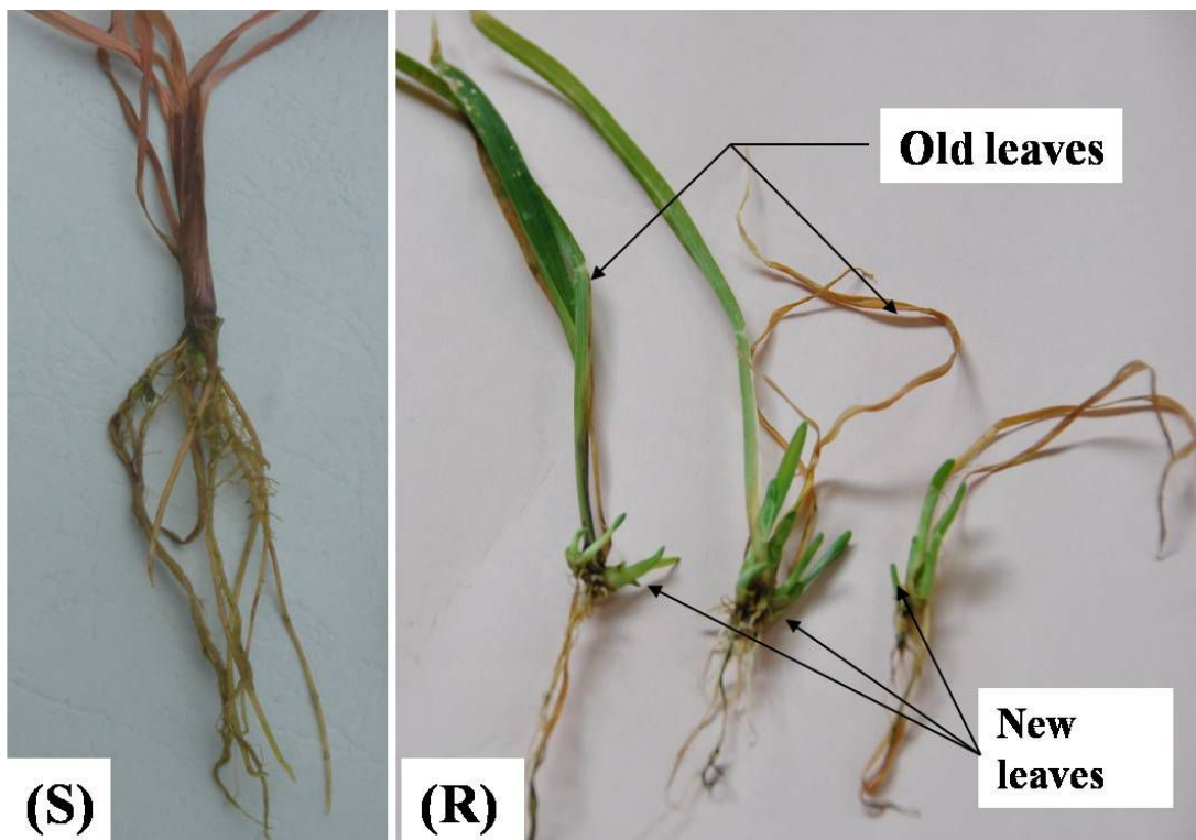
Appendix B Phenotypes of R and S biotypes of goosegrass 15 d after treatment with 250 mM glyphosate.