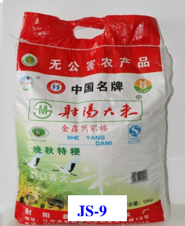
Appendix C Nine commercial Jiangsu rice samples.